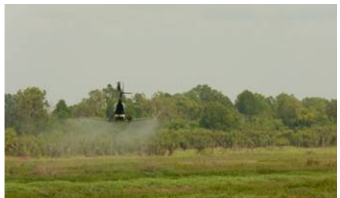
Helicopter spraying on the dam and floodplain

Friends of Fogg Dam Inc. PO Box 1505, Humpty Doo, NT, 0836 www.foggdamfriends.org