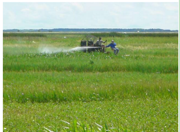
Airboat spraying on the floodplain

The work of FOFD in cooperation with Parks has identified an enormous problem which will require continual work to control, let alone eradicate: the Olive Hymenachne at Fogg Dam. It takes an all out effort and our results are encouraging. Over this project we have worked with airboats, Quicksprays, quad bikes & helicopters. Our 2011 grant is now finished and is being acquitted. We will be seeking further funding to continue the work. Below are two photos of recent December activity - helicopter spraying and burning-off next to the causeway on weed sprayed at earlier working bees.