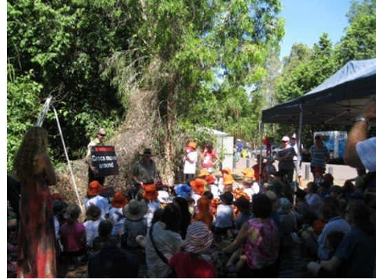
Be Crocwise was a popular talk