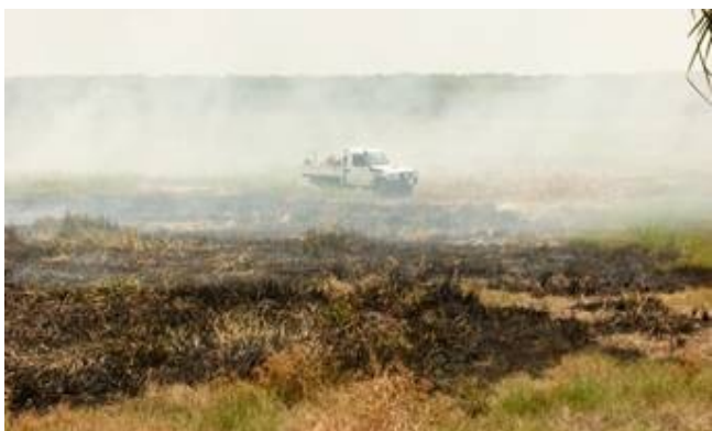
Burning beside the causeway