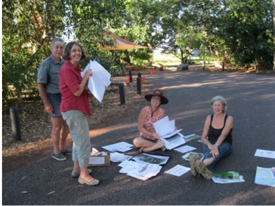
Preparing the displays